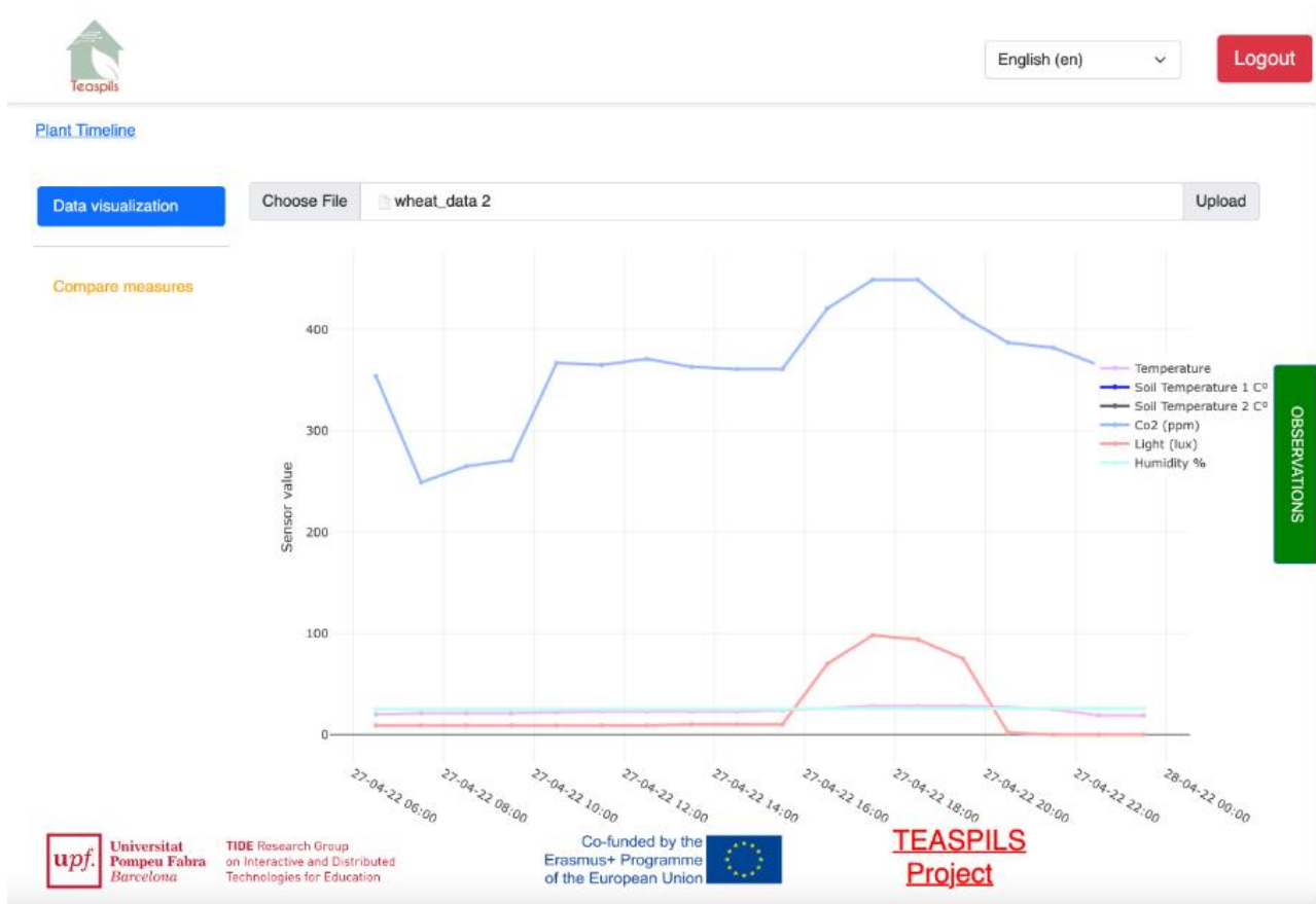
Figure 1- Data visualization tool.

A snapshot of the status of the plant at a given time could be displayed (Figure 2) by navigating through the points in the timeline. This screen also shows if the plant requirements are being addressed properly or not. Colors act as alerts and their thresholds can be configured.