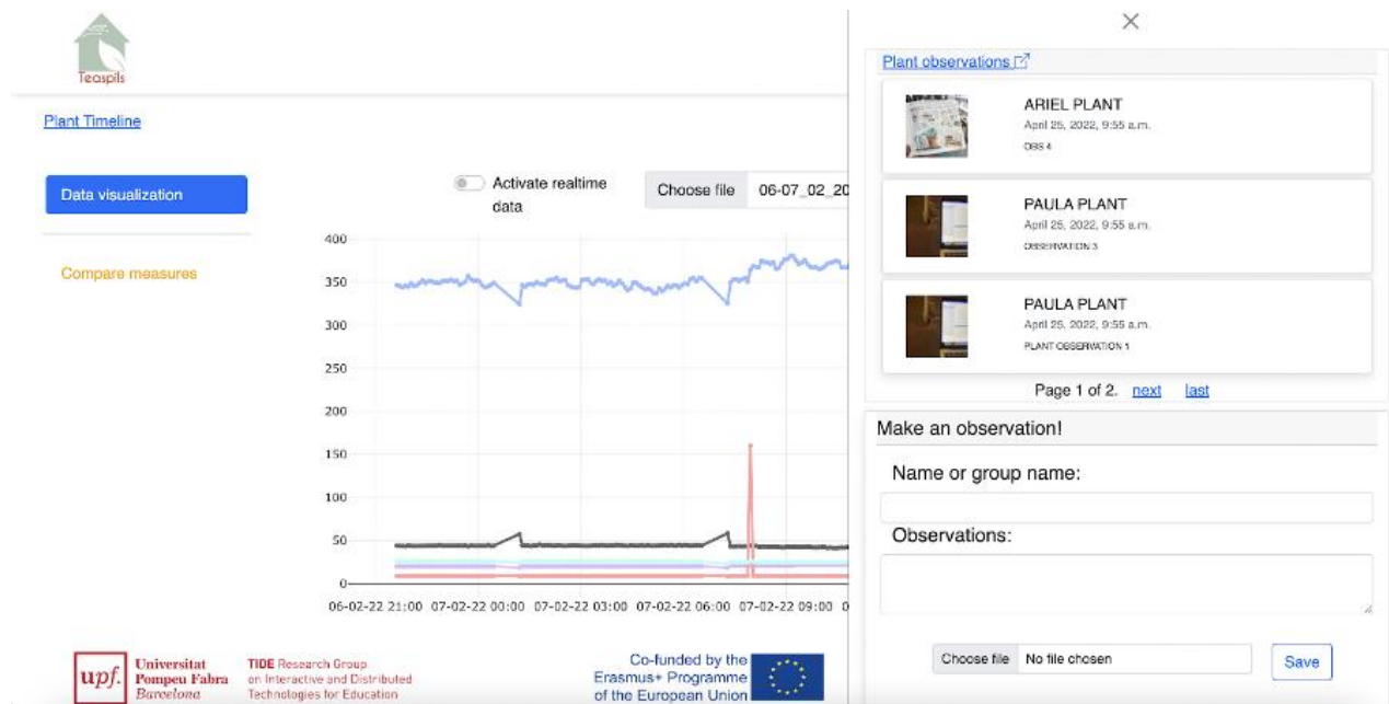
Figure 3. Observations module (at plant level)

Furthermore, an observation module is available to register additional comments and insights made by users about their interactions and to contextualize what's happening with the plant. These observations could be made at two different levels, at the plant level, registering the overall progress of the plant experiment, and at a given point in time, enabling users to register their ideas over punctual events and moments in the experiment.